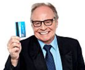
7 Outrageous Credit Cards For Those Of Us That Have Excellent Credit Next Advisor