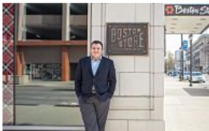
Highest-paid executives of Milwaukee area-based public companies pocket millions:...