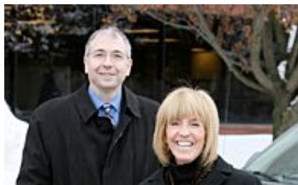
Plugged in: Johnson Controls focusing on hybrids - Milwaukee - Milwaukee Business Journal