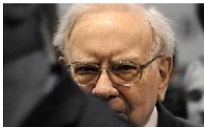
Buffett's Empire Is In Danger... And He Knows It The Motley Fool